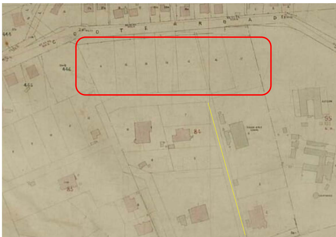
Figure 210 Part of Bowman X showing subdivision along the north side of Hadfield Terrace (red rectangle), Hukarere Road leading to Hadfield Terrace Hukarere School, Mahia, no. 11 Gladstone Road, the Coach house Hukarere House and Taumata.