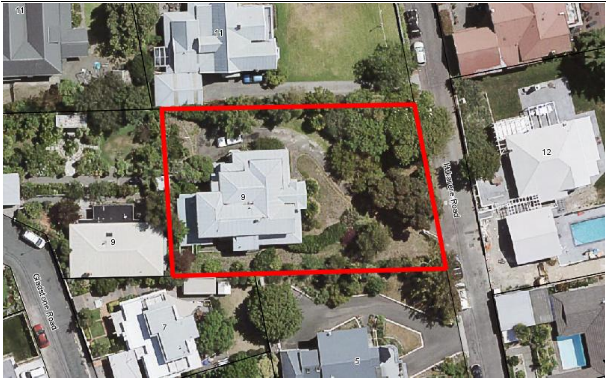
Figure 208 Extent of property at 9 Hukarere Road.