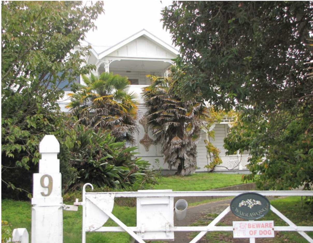
Figure 207 F.W. Williams House Te Rawhiti 9 Hukarere Road. Source: Chris Cochran, May 2019