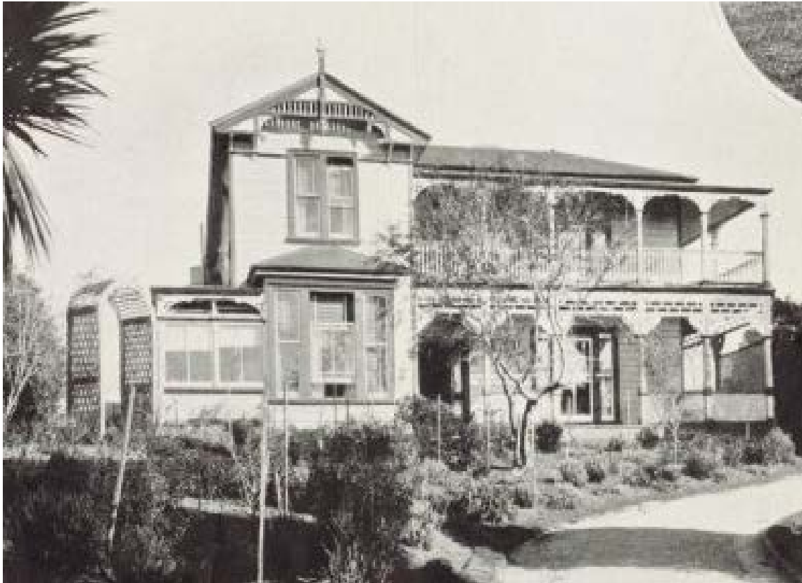
Figure 212 9 Hukarere Road F.W. Williams House Te Rawhiti