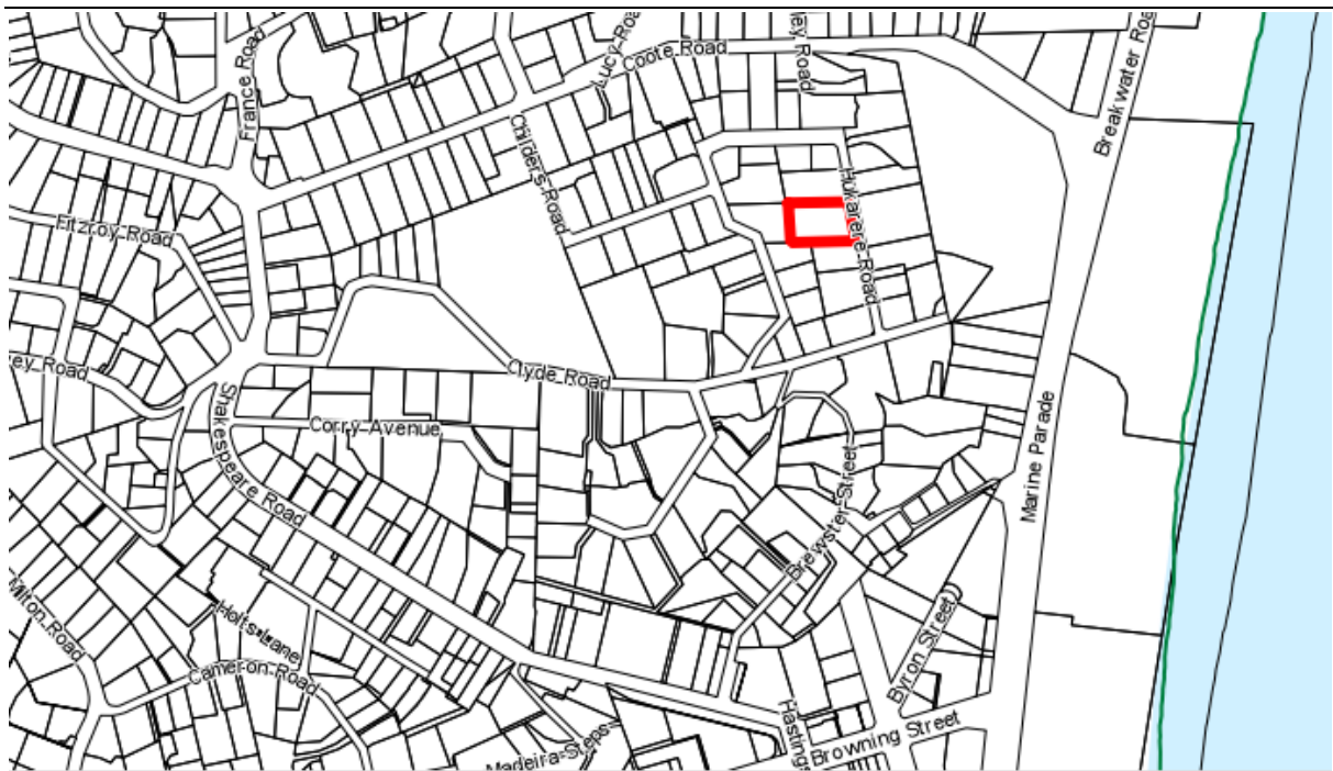
Figure 209 Location of 9 Hukarere Road within Napier.

Architect: Unknown Builder: Unknown. Robert Holt was the builder for an addition of a bathroom in 1908 and builders McKenzie and Walker further added to the building in 1926 (Holmes, 2002).