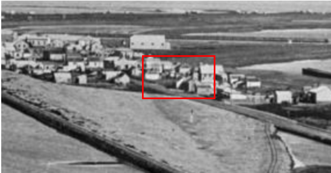
Location of 32 Hardinge Road 1880s.