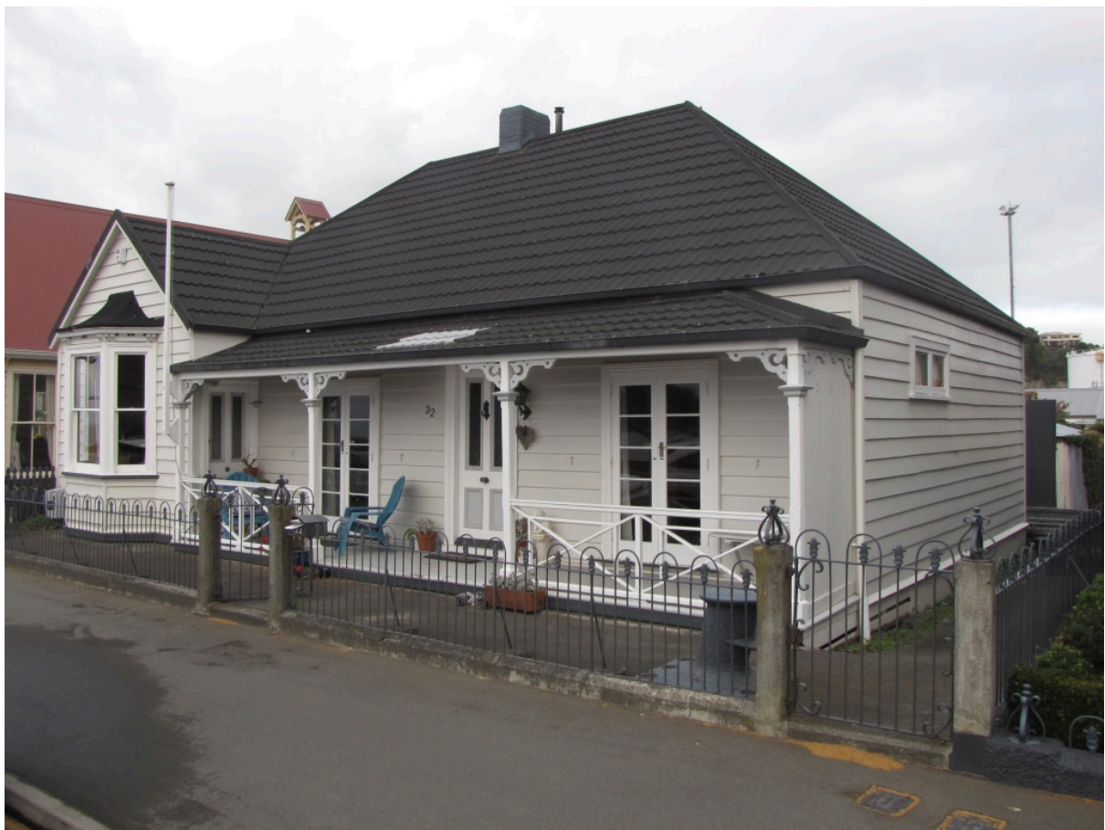
Figure 171 32 Hardinge Road beside Wilson Hall.