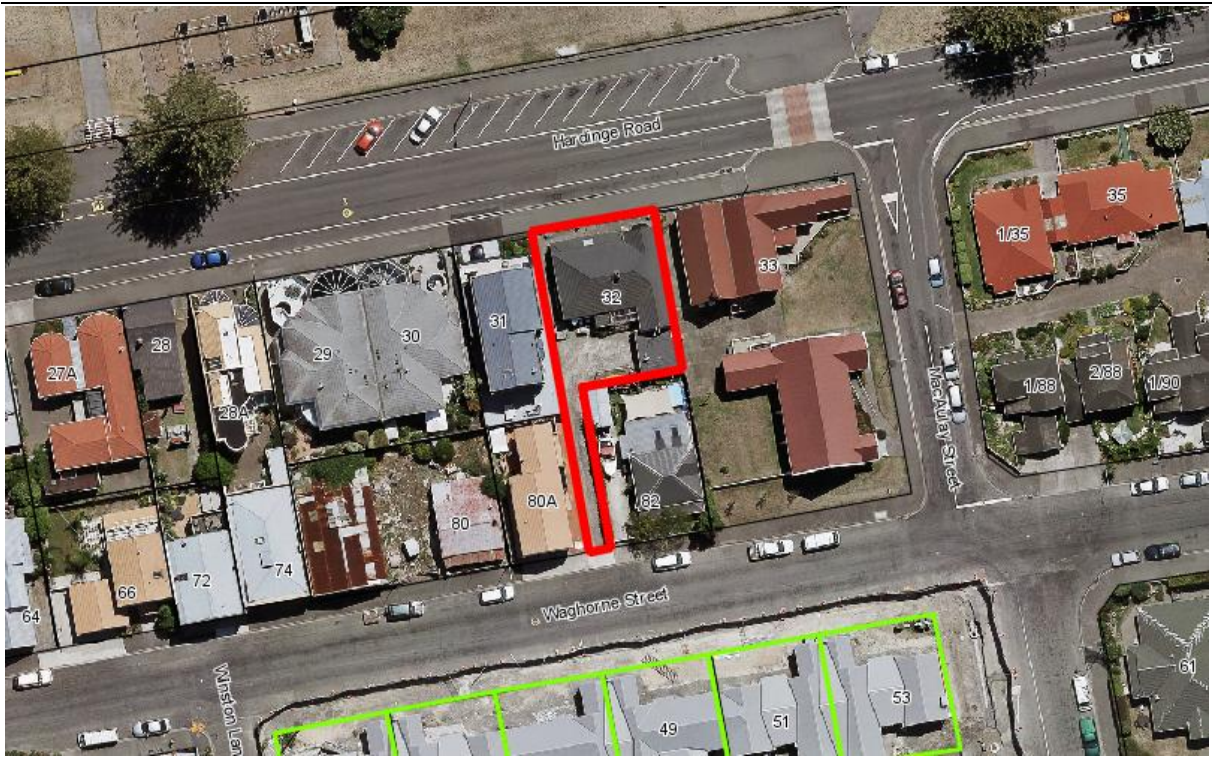
Figure 172 Extent of 32 Harding Road.