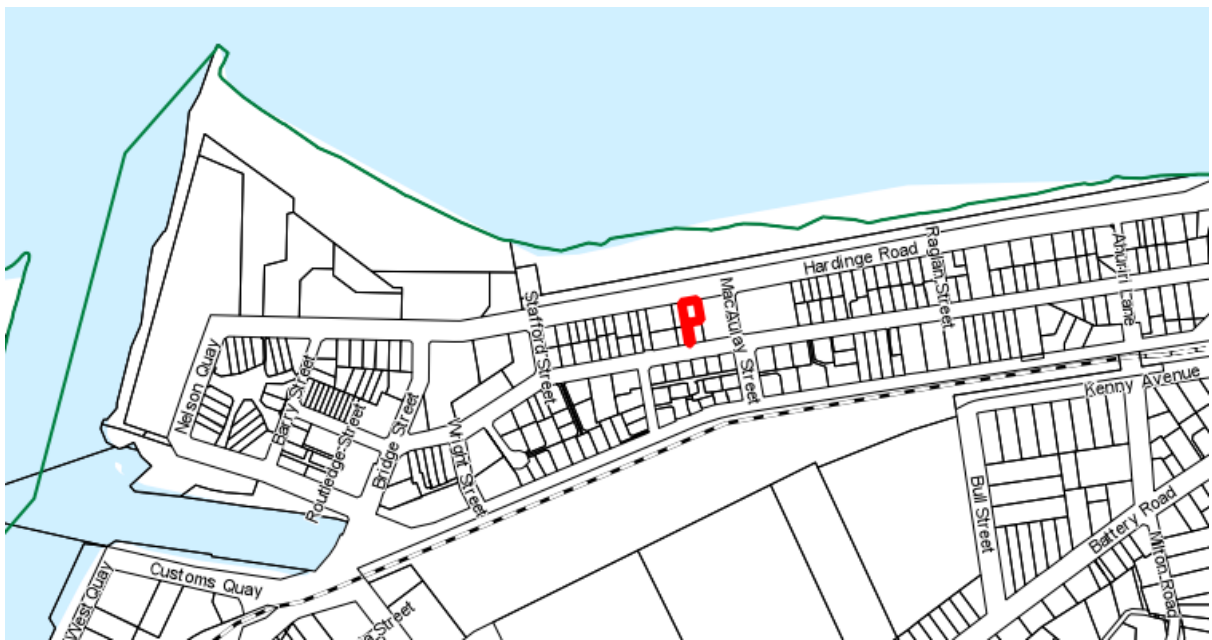
Figure 173 Location of 32 Harding Road