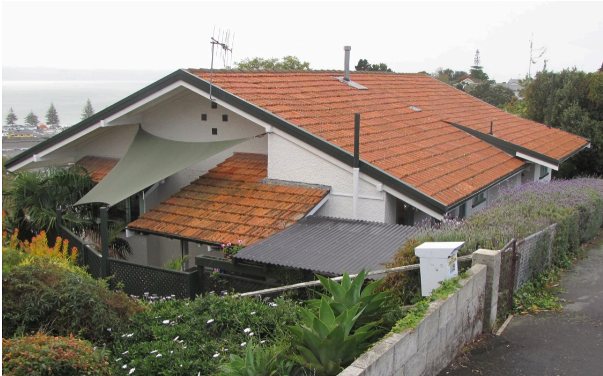
Figure 128 28a George Street, view from the road. Source: Photographer: Chris Cochran, April 2019.