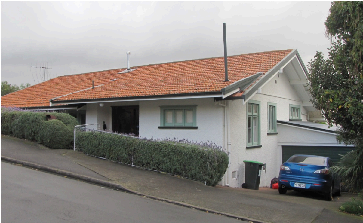
Figure 129 View from below. Source: Photographer Chris Cochran, April 2019.