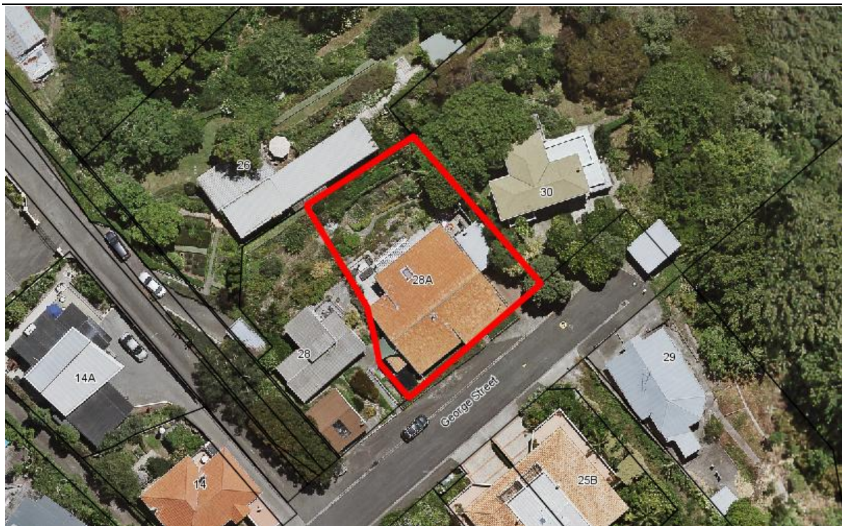
Figure 130 Extent of 28sa George Street