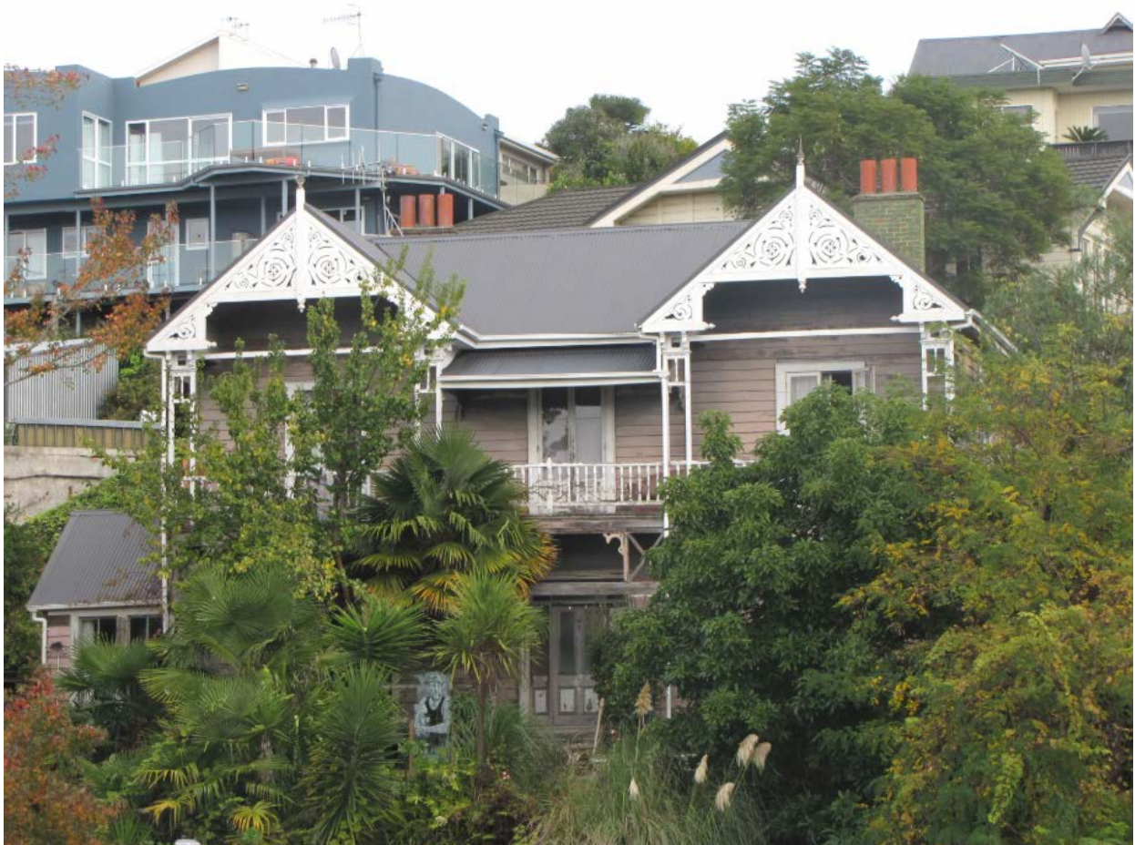
Figure 325 Blythe House 23 Sealy Road, Napier.

Construction date: Date of original house unknown, but a tender for additions and alterations occurred in February 1881 – so it was prior to this date.