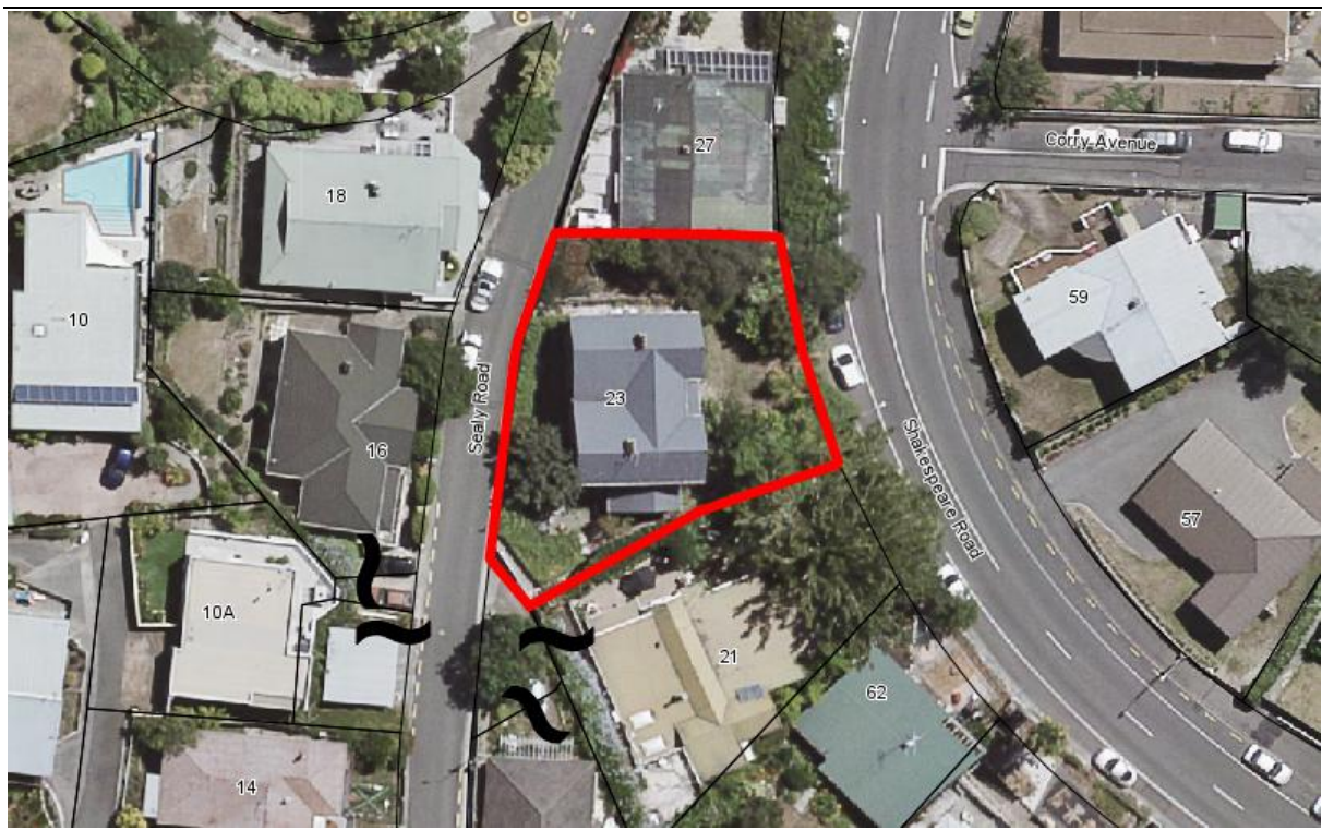
Figure 327 Blythe House and land PT LOT 2 DDP 876, CT 54/181.