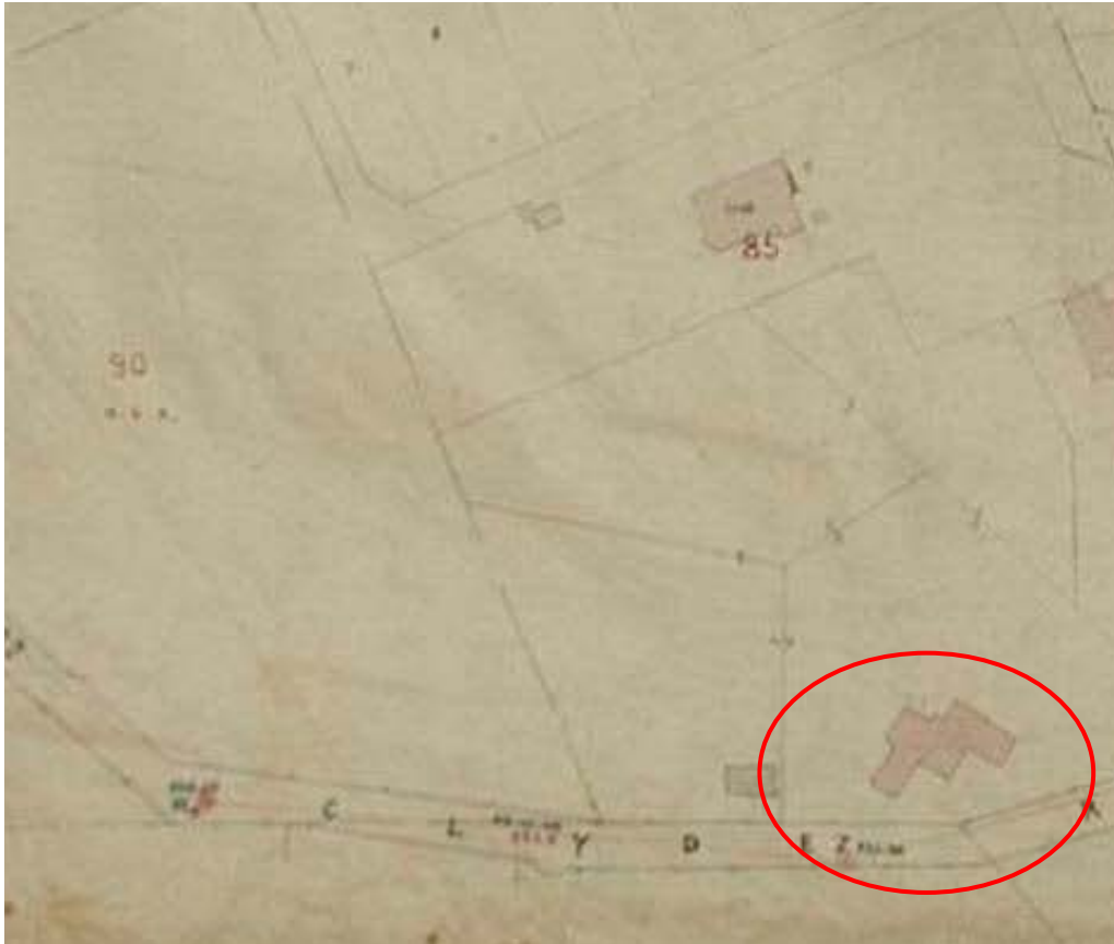
Figure 96 Part of Bowman Plan X c. early 1880s showing 17 Clyde road at bottom of picture.

Portions of the house date to the early 1860s, possibly slightly earlier, (though the date of construction is generally attributed to 1860). The house was given the name 'Prospect', with Mrs Begg placing advertisements for staff needed at Prospect over the decades (the first mention of this name was published in early 1865). Rooms were added from early on to accommodate a growing family, and Frederick Bowman's map of Napier lots in the 1880s shows that the outline of the house then is much as it is today – with only small extensions added after that point.