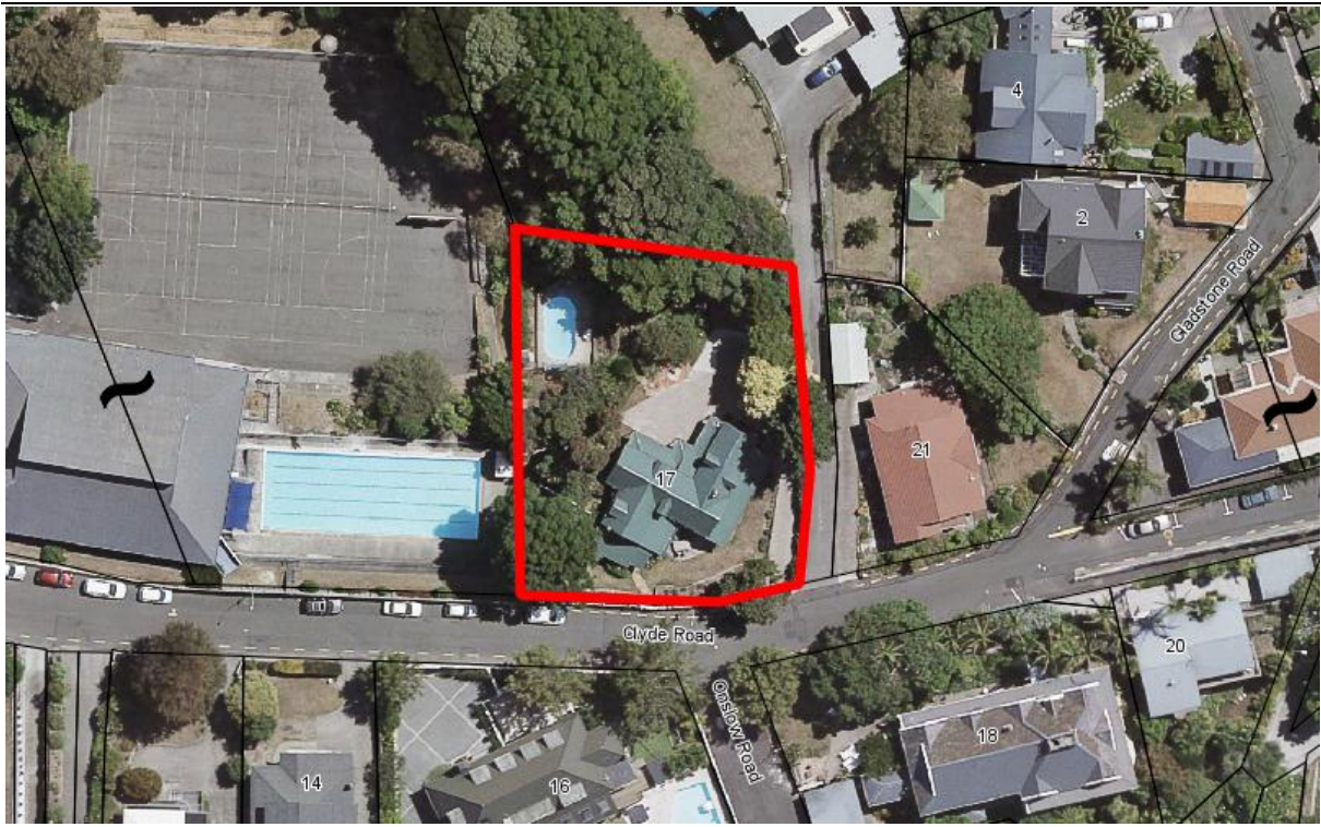
Figure 93 Extent of 17 Clyde Road