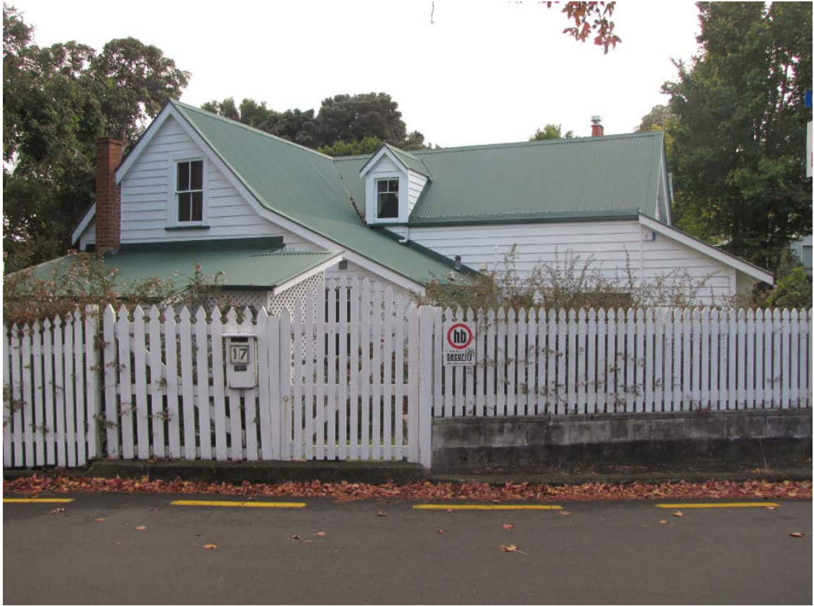
Figure 91 17 Clyde Road.