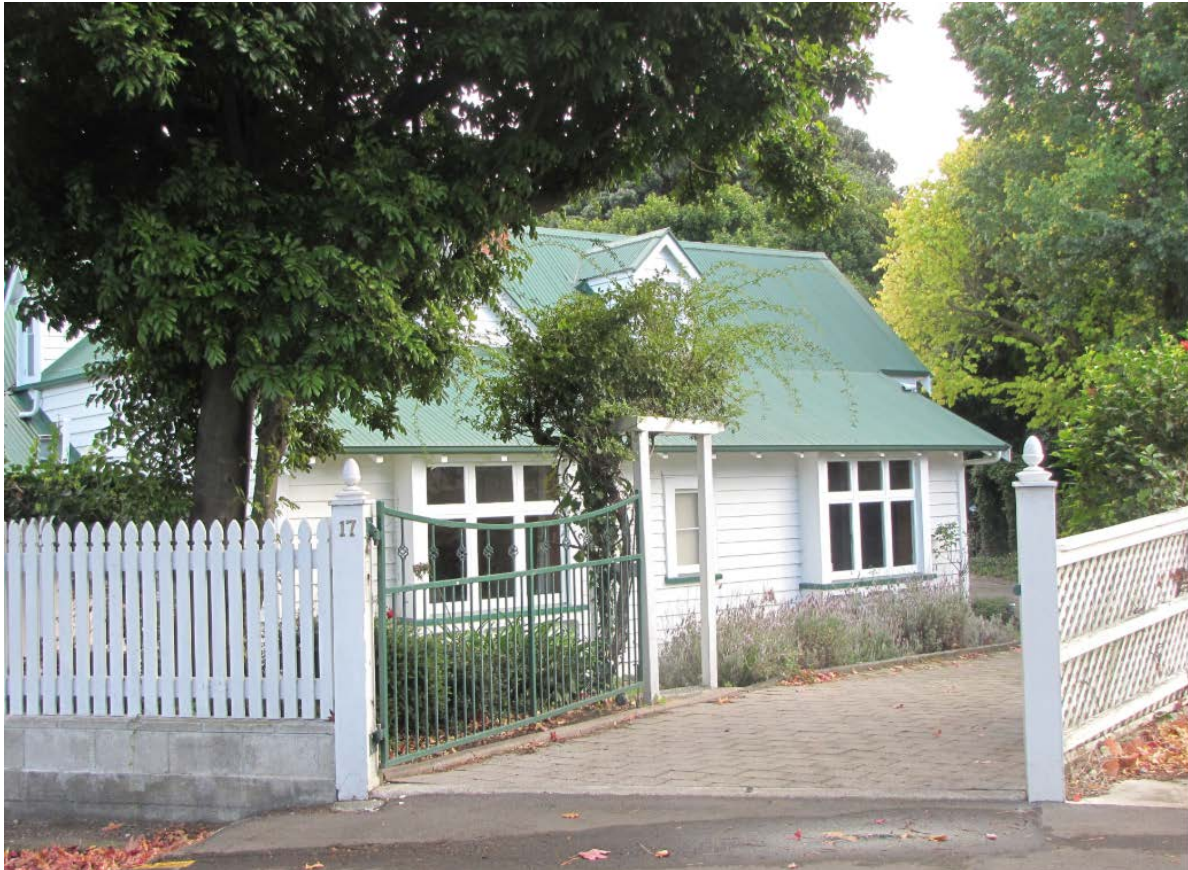
Figure 90 17 Clyde Road from the gate Source: Chris Cochran May 2019