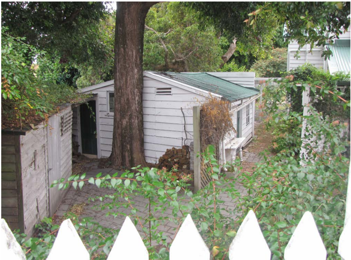
Figure 92 View over fence into backyard of 17 Clyde Road