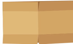
and flattening all of your cardboard (you can cut down your larger pieces).

We've pulled together our top tips to make the most of your paper & cardboard crate.